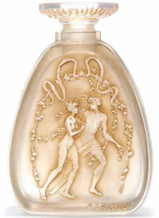
拉利克「牧歌」/ René Lalique h9.3 × w6.5 × d3.5 cm