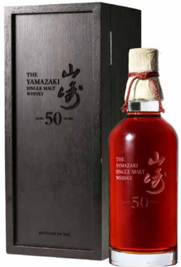
三得利單一麥芽威士忌“山崎 50 年” Yamazaki 50 years

In the whisky and vintage wine sale held in Hong Kong last November 24, 12 whisky with extremely high rarity value from the Japanese collectors were included. Suntory's single malt "Yamazaki 50 years" is very rare value in the market. This whisky was kept carefully by the owner who loves whisky and bid by an oversea collector at HKD 1.21 million. Is such whisky in your home, warehouse or bar? Its price is rising silently.