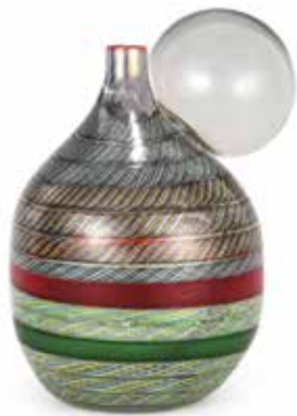
大平洋一 / Yoichi Ohira h22 × w16.5 × d13.5 cm

Est-Ouest Auctions has rich experiences of selling private and museum collections. If you have any related inquiries, please do not hesitate to contact us.