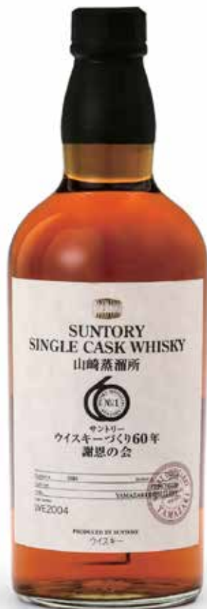
Suntory Single Cask Whisky Yamazaki Distillery 60 years of making whisky Testimonial Party 三得利單桶威士忌 山崎蒸餾所威士忌製造 60 年謝恩之會

In addition to Yamazaki's 50 years of attention, another non-selling product that is very rare in the market, "Suntory Single Cask Whisky Yamazaki Distillery 60 years of making whisky Testimonial Party". The range of estimate is HKD 30,000 - 50,000, and it is finally sold at HKD 302,500 which is 10 times the low estimate. Limited production of whisky is highly scarce and continues to be popular. Please do not hesitate to contact us if you own this kind of bottles.